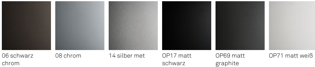
06 schwarz chrom