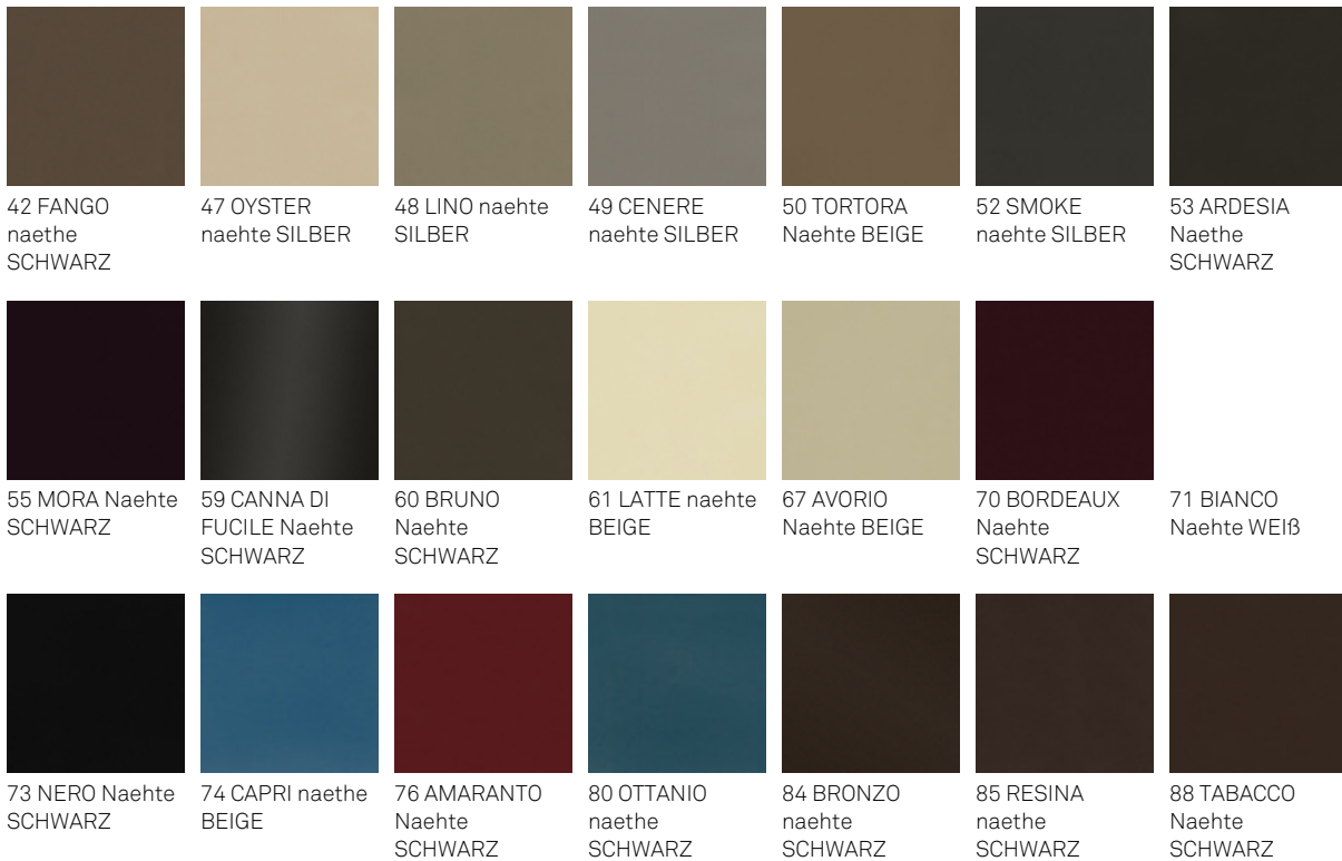
42 FANGO naethe SCHWARZ