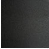
GM69 graphit gaufriert