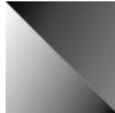
extra hell facettiert