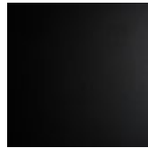
OP17 matt schwarz