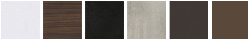
LM02 weiss climb