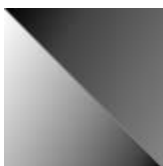
extra hell graphit