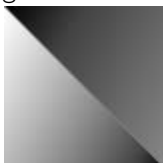
extra hell graphit