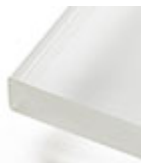
extra hell weiß