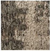
baumwolle und chenille Darwin