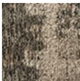
baumwolle und chenille Darwin