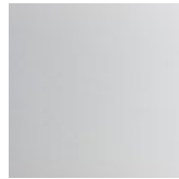
GFM71 weiss gaufriert