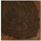
Mdf furniert mit nussbaumschnitt