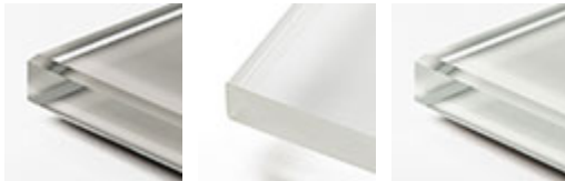
extra hell grey