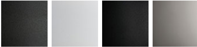
GFM69 graphit gaufriert