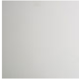
OP71 matt weiß