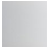
GFM71 weiss gaufriert