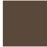
LM22 biber Ottawa Fenix