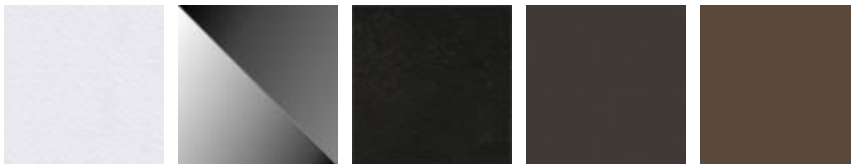
LM02 weiß climb