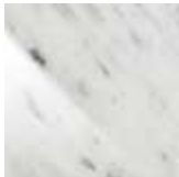
BC weiss Carrara