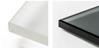
extra hell weiß