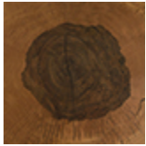
schnitt von Eiche baumstamm