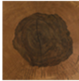
schnitt von Eiche baumstamm