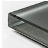
glas extra hell geätzt graphite lackiert