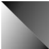
extra hell graphit