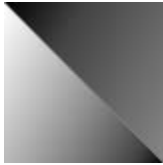
extra hell graphit