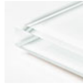
glas extra hell geätzt weiß lackiert