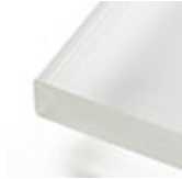
extra hell weiß