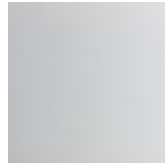
GFM71 weiss gaufriert