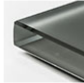
glas extra hell geätzt graphite lackiert