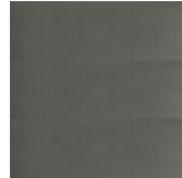
OP0 lackiert transparent