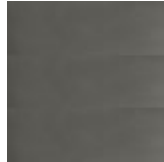
OP0 lackiert transparent