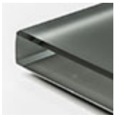
glas extra hell geätzt graphite lackiert