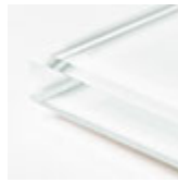
glas extra hell geätzt weiß lackiert