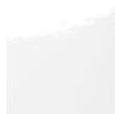
L7 weiß glänzend lackiert