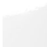
L7 weiß glänzend lackiert