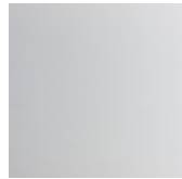
GFM71 weiss gaufriert