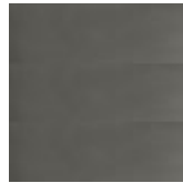
OP0 lackiert trasparent