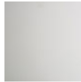
OP71 matt weiß