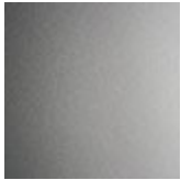
14 silber met