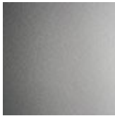
14 silber met