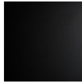
OP17 matt schwarz