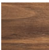
NC nussbaum canaletto