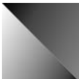
extra hell facettiert