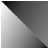
extra hell facettiert