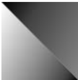
extra hell facettiert