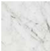
BCO weiß Carrara matt