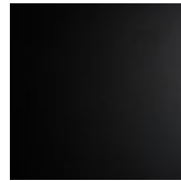
OP17 matt schwarz