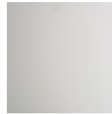
OP71 matt weiß