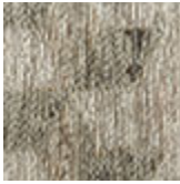
schwarz baumwolle und chenille Rubik