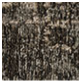
baumwolle und chenille Mapoon