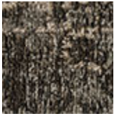
baumwolle und chenille Mapoon