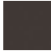
LM21 London grau Fenix