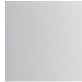
GFM71 white embossed