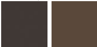
LM21 grey London Fenix