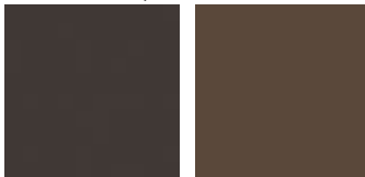
LM21 grey London Fenix