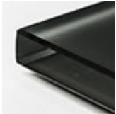
extra clear frosted glass black painted