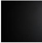
OP17 matt black