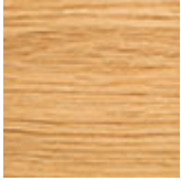
RN natural oak