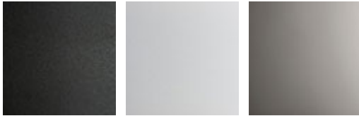
GFM69 graphite embossed