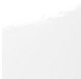
polished white laminated