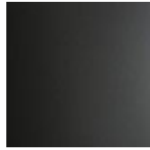
OP69 matt graphite