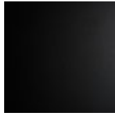
OP17 matt black