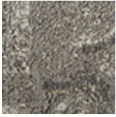
cotton chenille Chennai