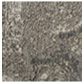
cotton chenille Chennai