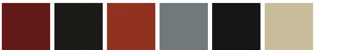
89 ROSSO CORSA