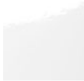
L7 polished white lacquered