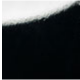
L3 polished black lacquered