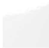
L7 polished white lacquered