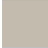
OP50 matt oyster