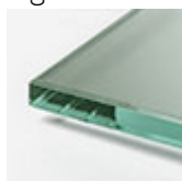
frosted and mirrored