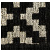
black cotton and chenille Halibut