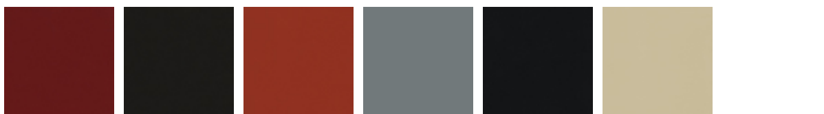
89 ROSSO CORSA