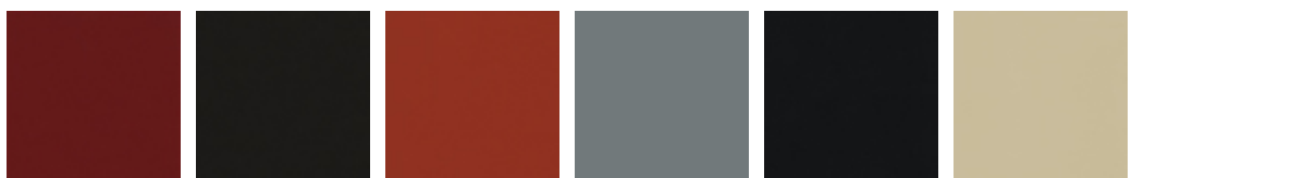
89 ROSSO CORSA