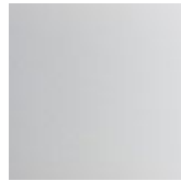
GFM71 white embossed