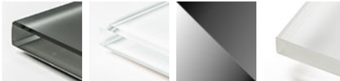
extra clear frosted glass graphite painted