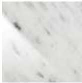
BC polished white Carrara