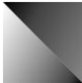
extra clear graphite