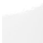
L7 polished white lacquered