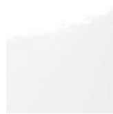
L7 polished white lacquered