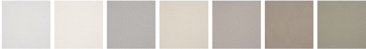
971 BIANCO 937 PALLADIO 972 CANOVA 947 OYSTER 959 ICE 939 NYMPH 949 CENERE