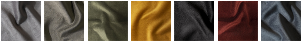
B232 B233 B234 B235 B236 B238 B239