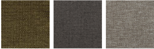
B405 B422 B712