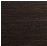
frRB burned oak stained ashwood