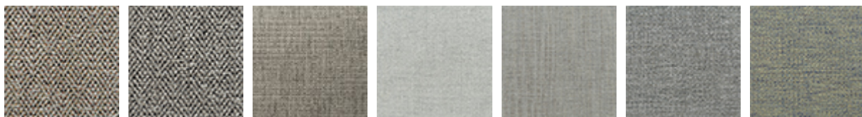
B720 B722 B403 B420 B521 B710 B711