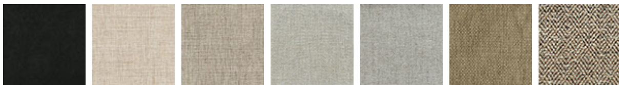
B932 B714 B713 B520 B530 B401 B721