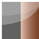
grey - bronze