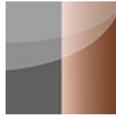
grey - bronze