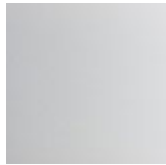
GFM71 white embossed