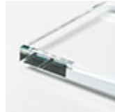
extra light transparent